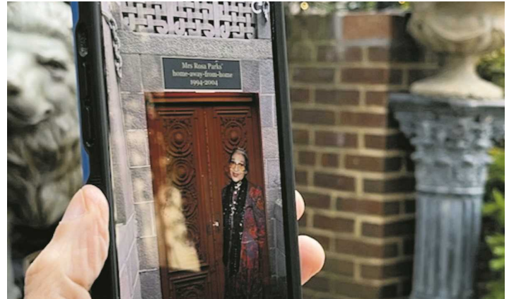
Through the app, you'll hear in augmented reality from figures including Rosa Parks, who lived at the Mansion on O Street near Dupont Circle later in life.